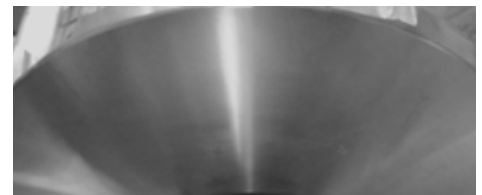
CLEAN SHEAVE PLATES

Dirty Sheaves should be cleaned with a mild abrasive to remove rubber and other wear contaminants as shown above by dirty Sheave. Dark wear patterns must be removed from the surface then cleaned off with an alcohol agent or brake cleaner to remove fine particulates.